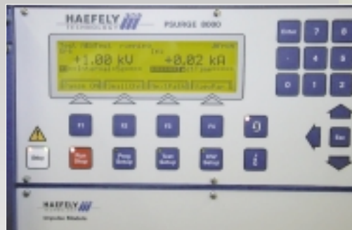
PREPARED TO MEET THE FUTURE