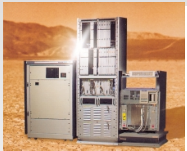
A Central office Telecom rack a typical test object for BELLCORE GR-1089 testing

The 1089 coupling unit performs switching sequences under program control.